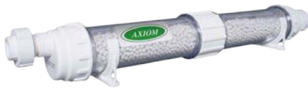
NC-2 "Full Kit" NC-2S "Hard Pipe Kit"